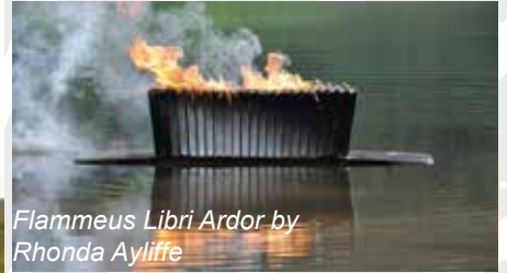
Flammeus Libri Ardor by Rhonda Ayliffe