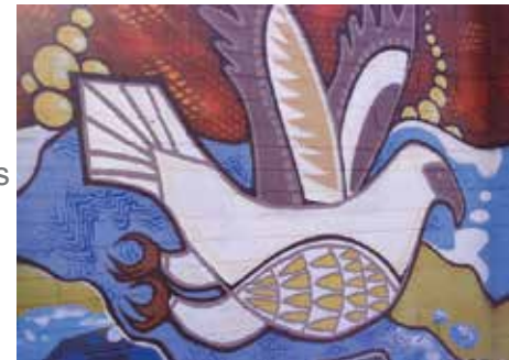
Swimming in Art mural, Narooma Swimming pool