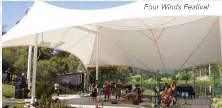
Four Winds Festival