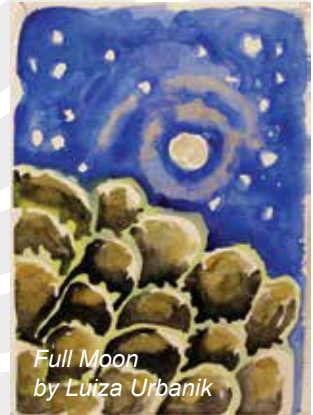
Full Moon by Luiza Urbanik