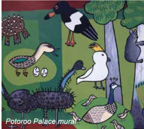
Potoroo Palace mural