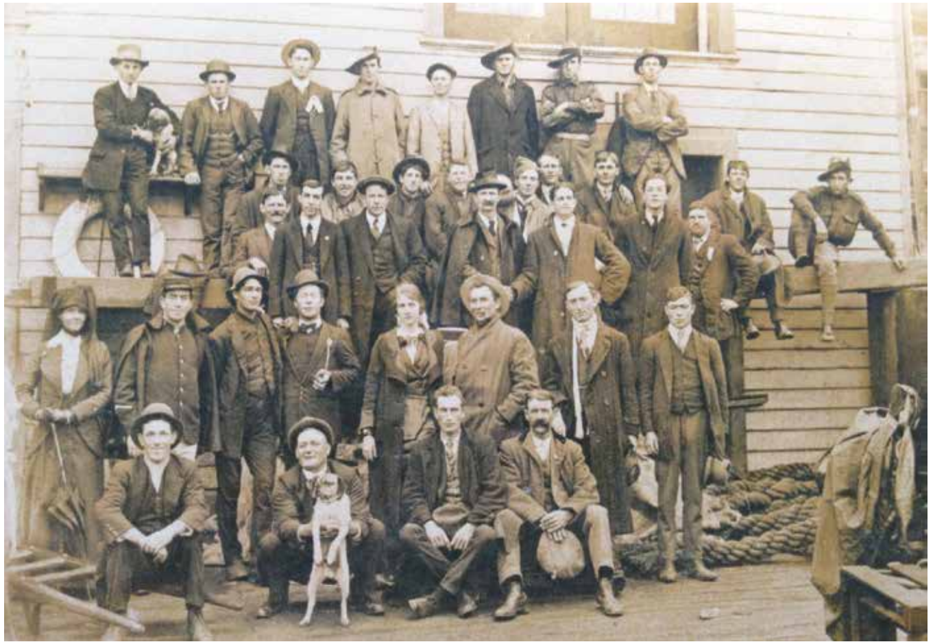
People at Tathra Wharf waving off soldiers embarking to the First World War, 1915.