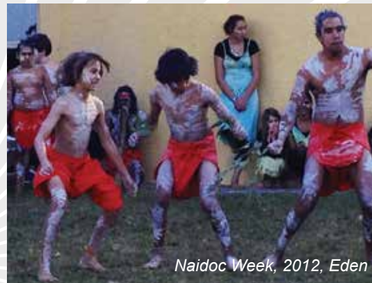
Naidoc Week, 2012, Eden