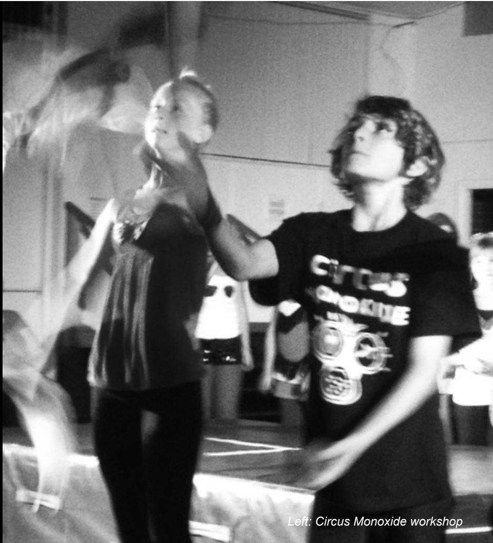
Left: Circus Monoxide workshop